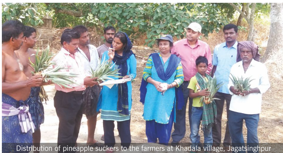
Distribution of pineapple suckers to the farmers at Khadala village, Jagatsinghpur