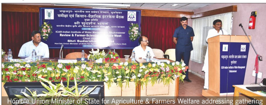
Hon'ble Union Minister of State for Agriculture & Farmers Welfare addressing gathering