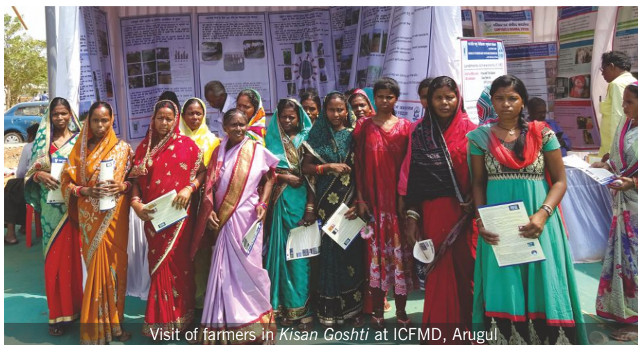
Visit of farmers in Kisan Goshti at ICFMD, Arugul