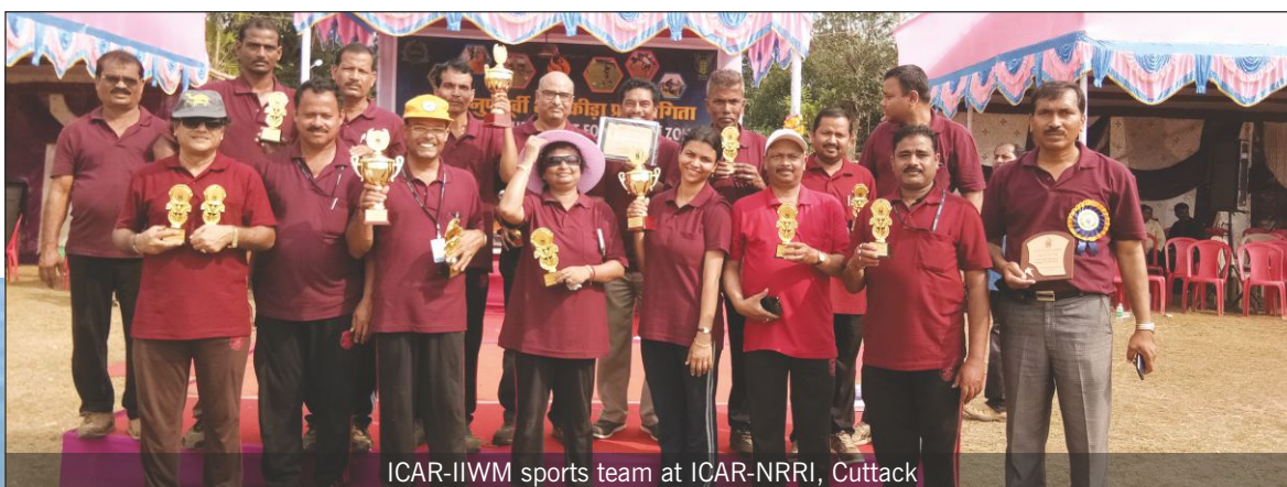
ICAR-IIWM sports team at ICAR-NRRI, Cuttack