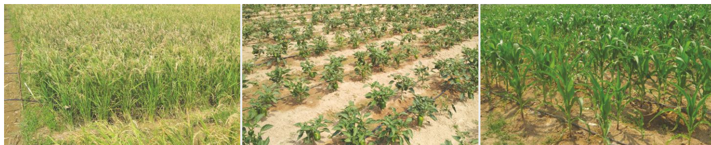
Drip irrigation in rice, capsicum and baby corn

*REY: Rice equivalent yield; DI: Drip irrigation; SI: Surface irrigation; Net income includes the cost of drip irrigation system (₹ 1.60 lakh ha -1 ) and water harvesting pond of size 40 m x 35 m x 2.5 m of costing ₹ 2.5 lakh